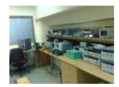
Kind 73 de Makis, SV1AFN – WWW.SV1AFN.COM